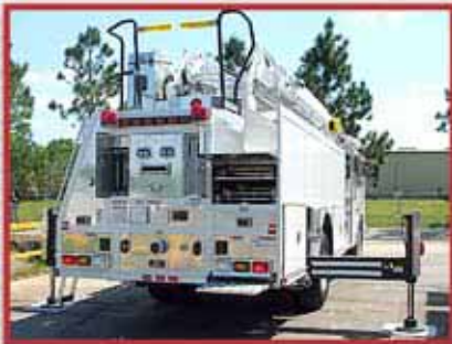
PIN-FREE JACK SYSTEM DEPLOYS IN UNDER 40 SECONDS

W ith over 24 years of aerial experience and ZERO structural failures or tipovers, E-ONE continues delivering on our founding principles of innovation and safety.