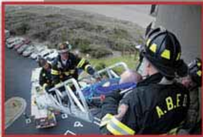
ONLY 75' AERIAL IN THE INDUSTRY WIDE ENOUGH FOR STOKES RESCUE