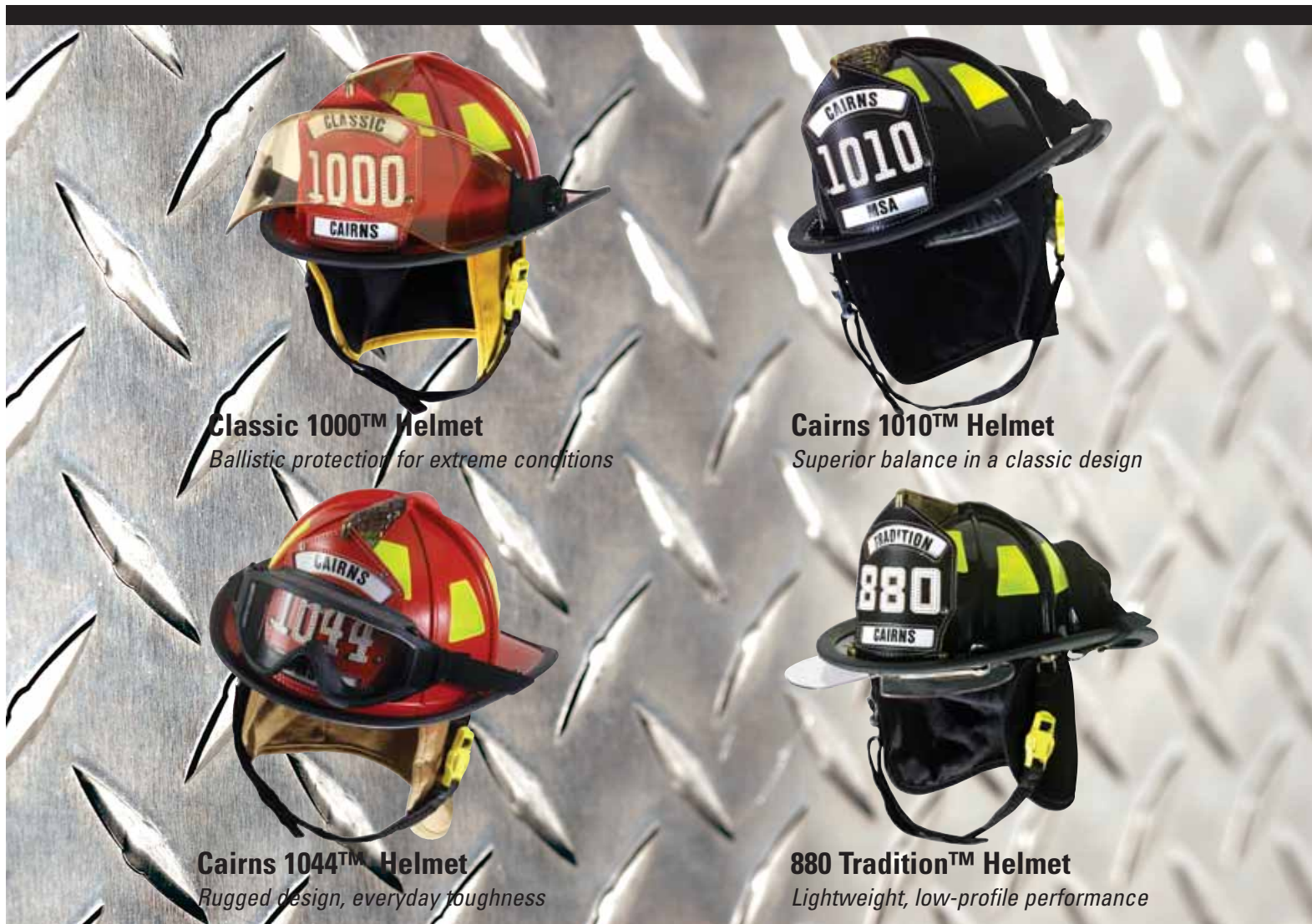
Classic 1000™ Helmet Ballistic protection for extreme conditions

Choose Cairns: Millions of firefighters for generations have!