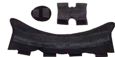
Deluxe Leather Headband Liners with Crown Pad

** Eye protection (goggles or faceshield) required for NFPA compliance * Not NFPA compliant † Available with 880 Tradition only ‡ Not available with 880 Tradition x Requires a 5" front with 880 Tradition only ▲ Not available with Cairns 1044