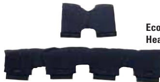
Economy Flannel Headband Liners