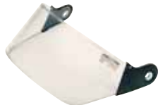
4" Standard Faceshield