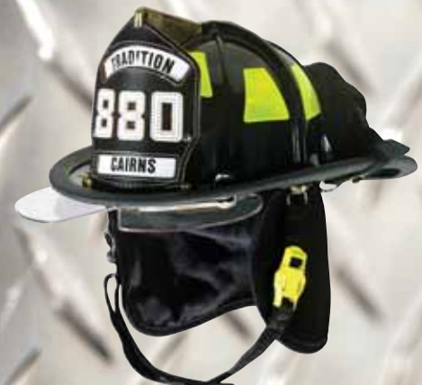
880 Tradition™ Helmet Lightweight, low-profile performance