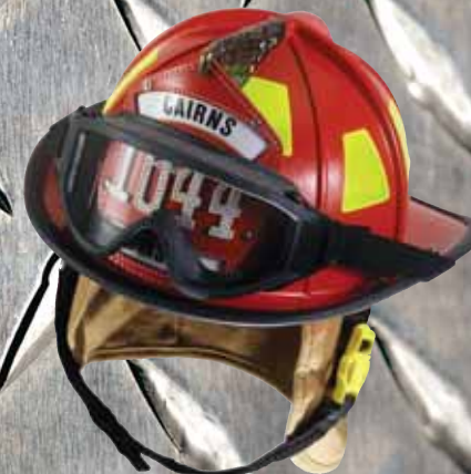
Cairns 1044™ Helmet Rugged design, everyday toughness