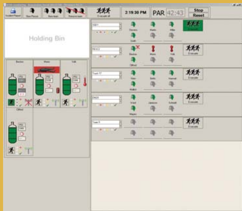
ICM TxR Accountability Screen

When critical events occur, such as the sounding of PASS or low-pressure alarms, it is important to keep IC informed. The base station automatically recognizes these events and that critical information is announced on the laptop screen via “pop-up” windows. The type of event and name of the firefighter are included in the message. Knowing that IC has many responsibilities and may not be constantly watching the computer screen, audible alarms also alert IC of critical events. When a PASS Alarm occurs, the laptop computer will alarm, using the same tones as the ICM TxR. When a low-pressure alarm activates, the laptop will sound the distinctive Audi-Larm® ring. Other events, such as thermal alarms, low battery conditions, and radio contact, can also be set up to inform IC on the laptop screen.