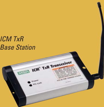
ICM TxR Base Station

The ICM TxR Accountability System is capable of monitoring 50 firefighters per base station. It is possible to connect multiple base stations to a single laptop.