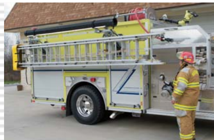
OPTIONAL ELECTRIC DROP DOWN LADDER STORAGE PLACES LADDERS AND EQUIPMENT AT GROUND LEVEL.