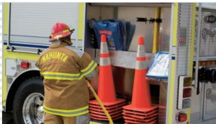
ROLL-UP DOORS OFFER INSTANT ACCESS TO ALL GEAR.

Practical and easily customized to you—the E-ONE Tradition Typhoon Pumper.