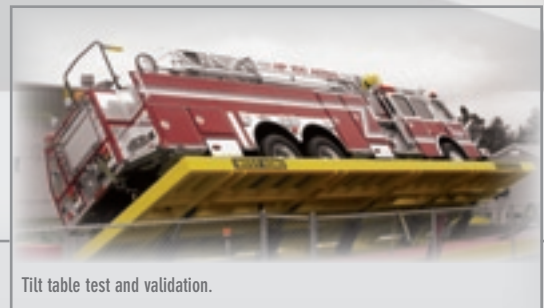
Tilt table test and validation.